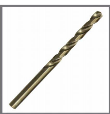
full ground Cobalt