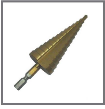
step straight flute TiN coated straight flute step drill with with hex shank