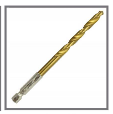
full ground TiN coated with hex shank