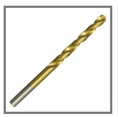
full ground TiN coated