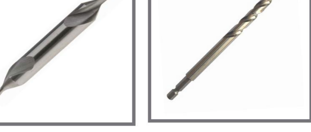
center combined drill two step drill bits with hex shank