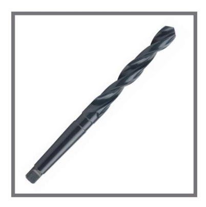
taper shank with black surface