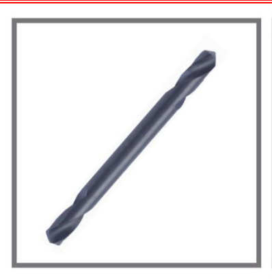
double flute with black surface tube and sheet shell drills